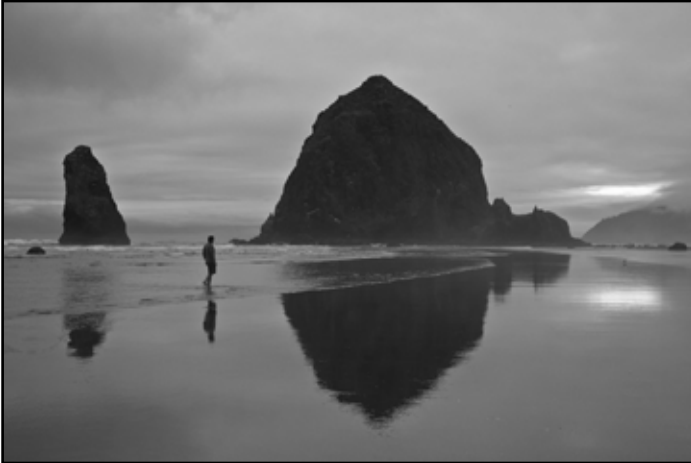
“Haystack Rock, Cannon Beach” by Theo Goodwin