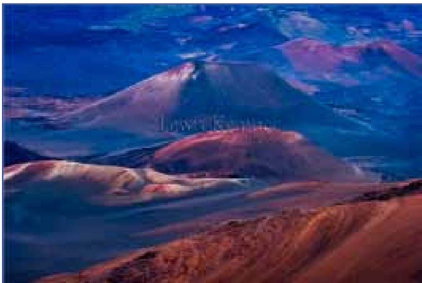
“Haleakala Crater, Maui, Hawaii”

SUNDAY, DECEMBER 4, 2011 Red Lion Hotel at Arden Village 1401 Arden Way, Sacramento