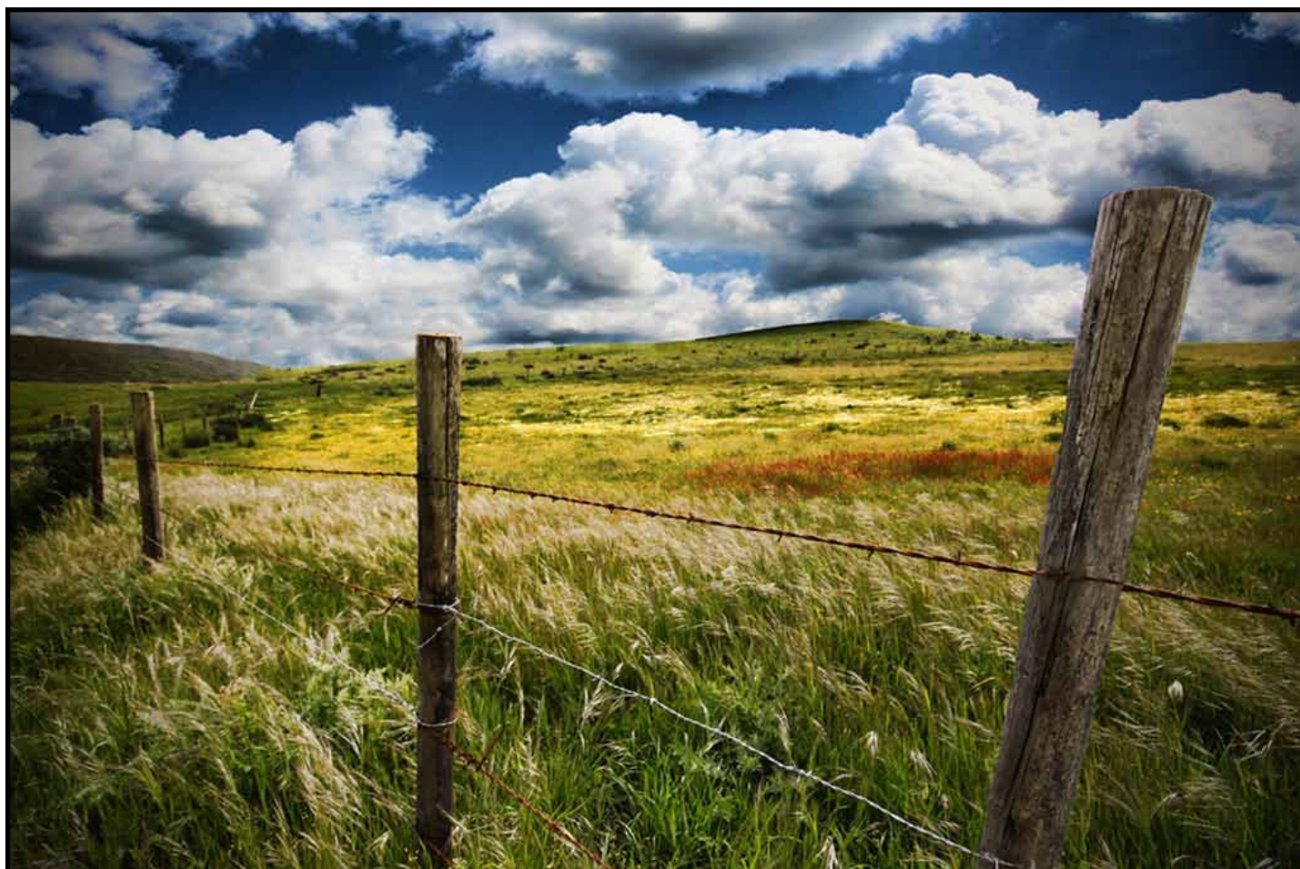
General Image of the Night “Fenced Field of Wildflowers” by Peggy Seale

Volume 74 Number 11 * November 2011 * www.sierracameraclub.com