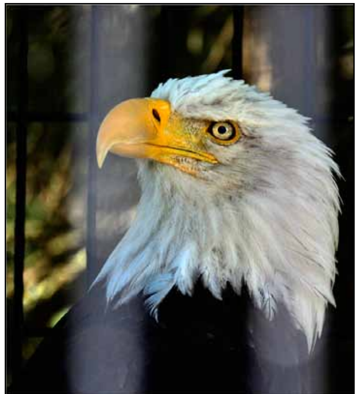
“Captive Bald Eagle” by Werner Krueger