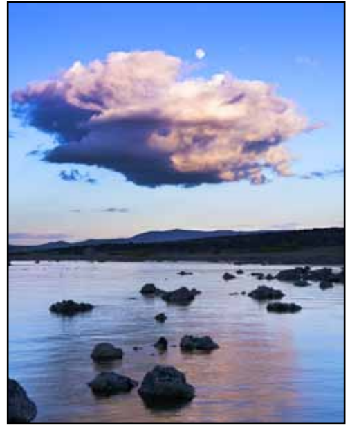
“Mono Lake Moonrise” by Gari Rae Gray