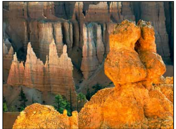
“Bryce Canyon Morning Glow” by Julius Kovatch