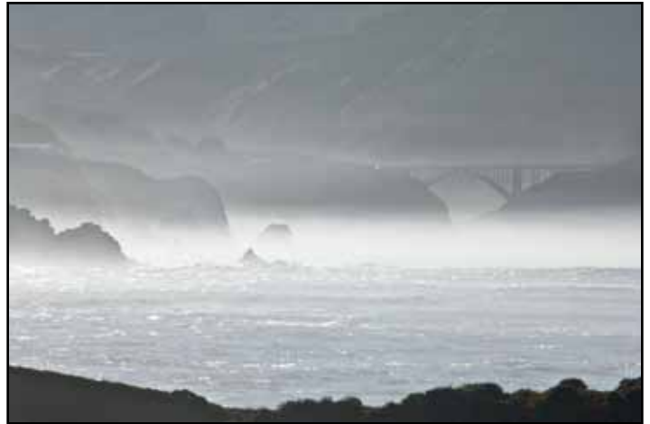
“Rocky Point Bridge” by Donn Reiners