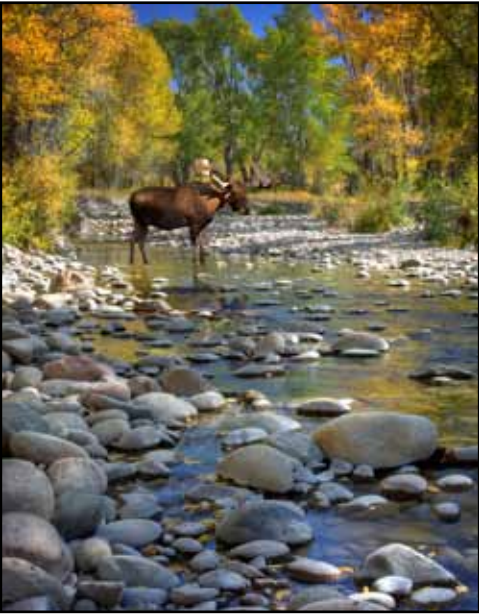
“Moose in River” by Lynne Anzelc