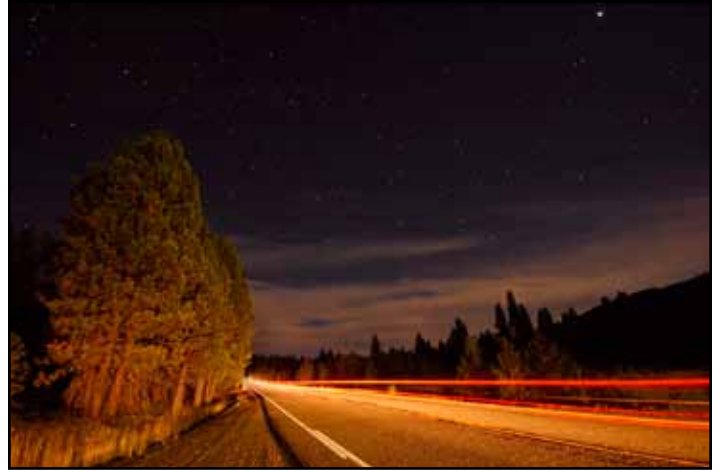
“Tail Lights on Starry Night” by Peggy Seale