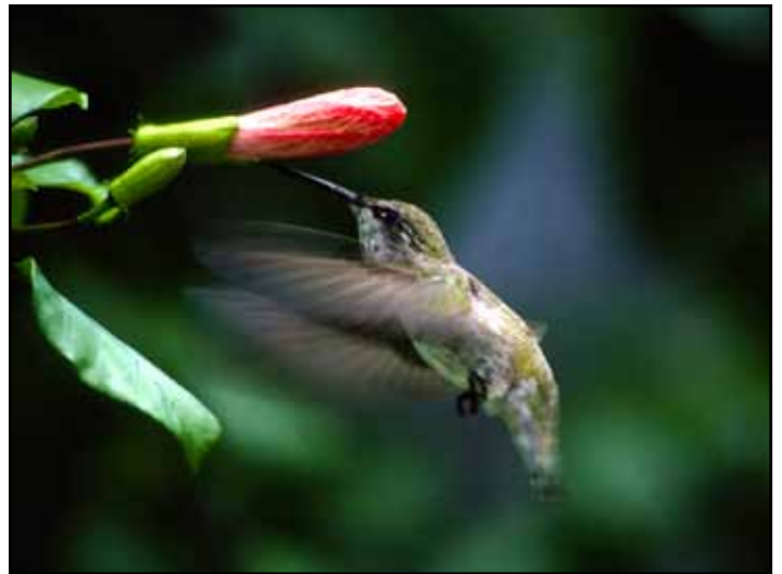
“Humming Bird Feeding” by Dorothy Farol