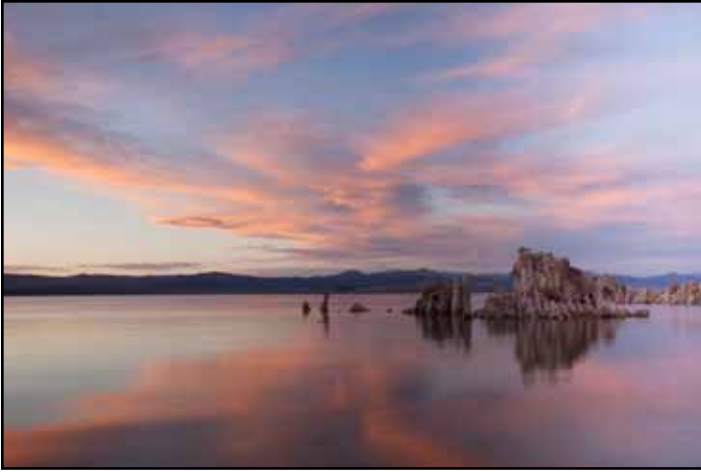
“Mono Lake”