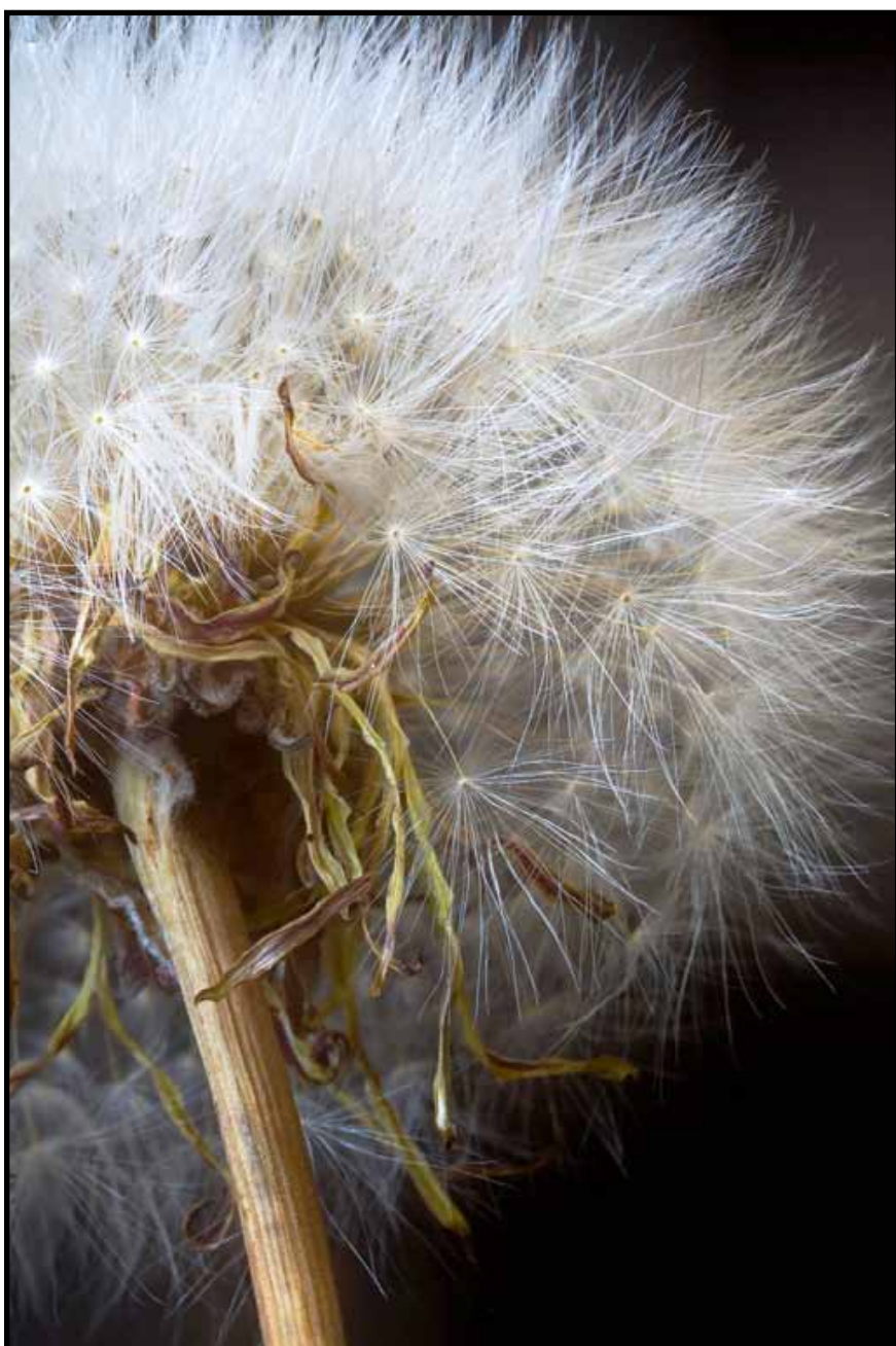
General Photography Image of the Night "Dandelion" by Lynne Anzelc

Volume 74 Number 9 * September 2011 * www.sierracameraclub.com