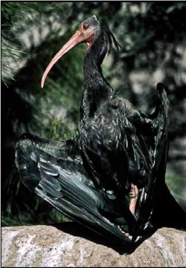
“Waldrapp African Hermit Ibis” by Dorothy Farol