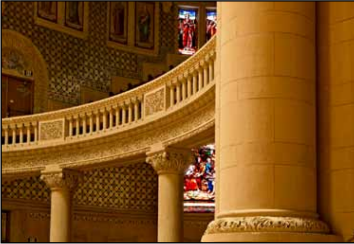
“Stanford Memorial Church”