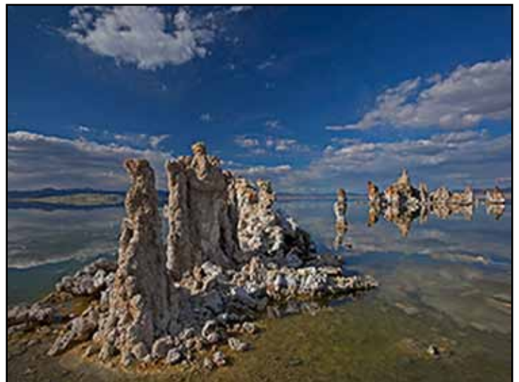
“Tufa Formations and Reflections” by Julius Kovatch