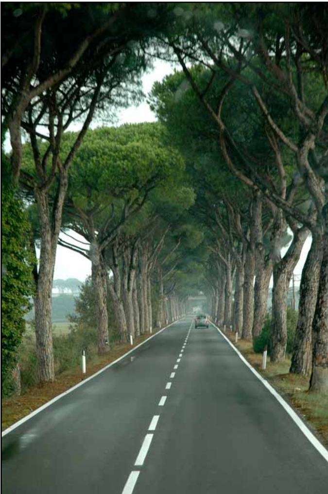
“Road Through Umbrella Trees” by Marcia Sydor