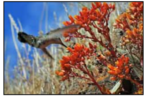
“Juvenile Anna’s Hummingbird Feeding”