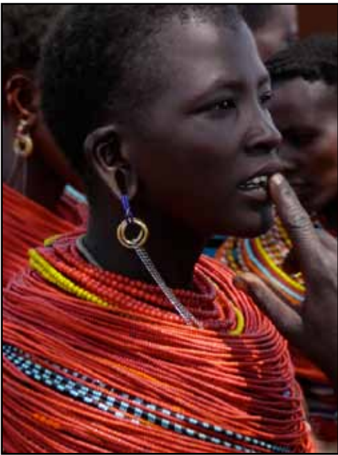
“Samburu Woman” by Valarie Trudeau