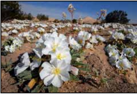
“Desert Primrose” by Willis Price