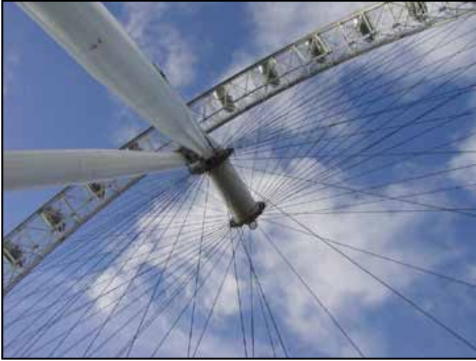
“One Big Wheel” by Allan Trimble