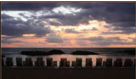
“Oahu Beach Sunset” by Peggy Seale