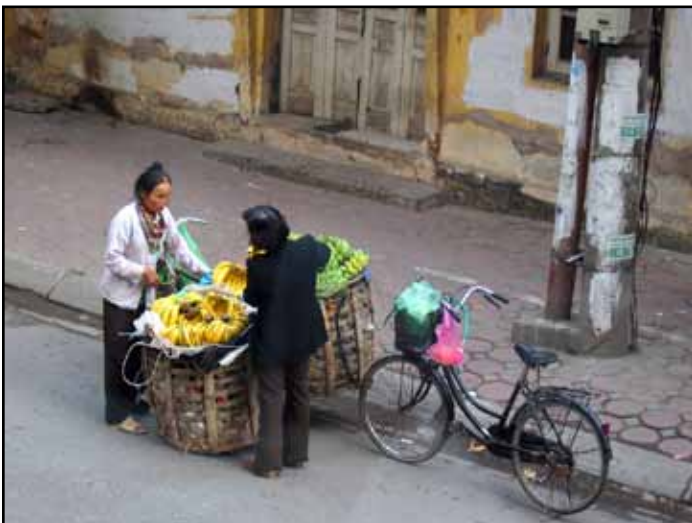
“Hanoi Banana Market”