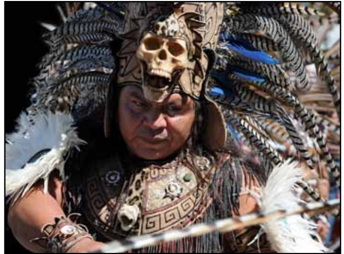
“Aztec Warrior” by Willis Price