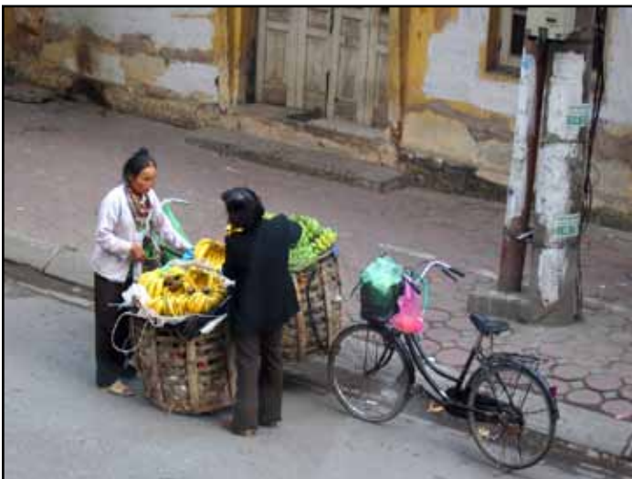
“Hanoi Banana Market”