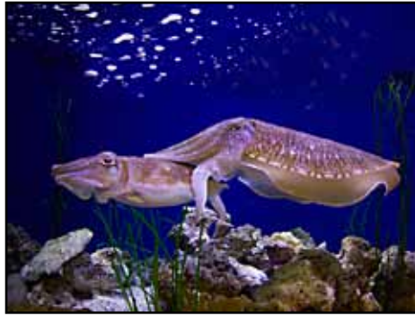
“Mating Cuttle Fish” by Truman Holtzclaw