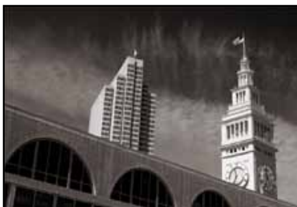
“San Francisco”