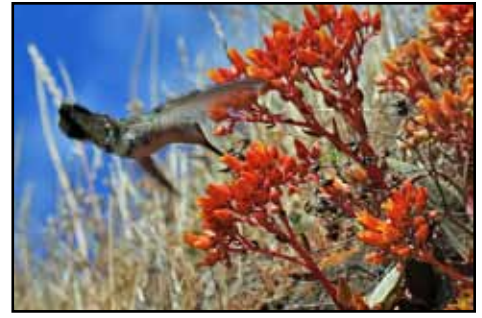
“Juvenile Anna’s Hummingbird Feeding”