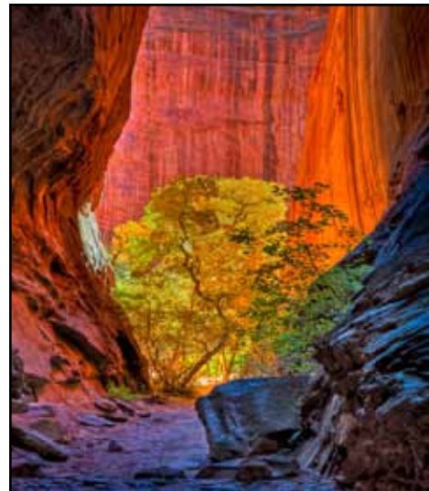
“Boulder Utah”