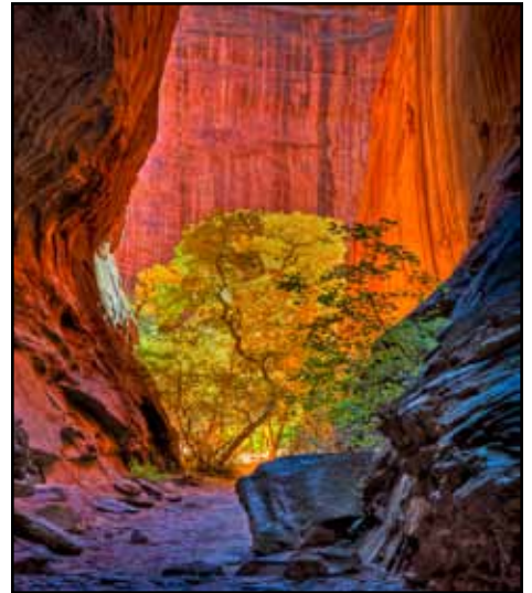
“Boulder Utah”