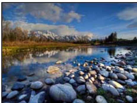
“Grand Teton Reflection” by Gay Kent