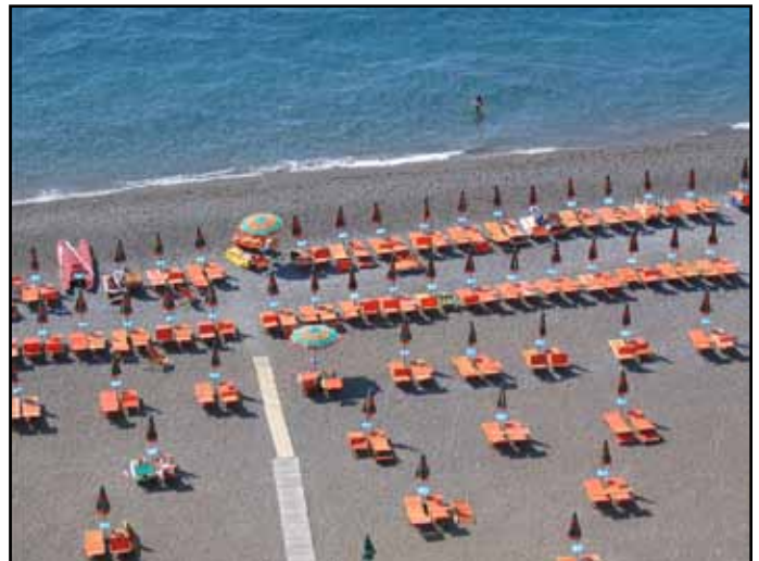
“Positano Beach” by Gary Cawood