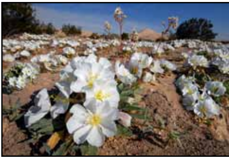
“Desert Primrose” by Willis Price