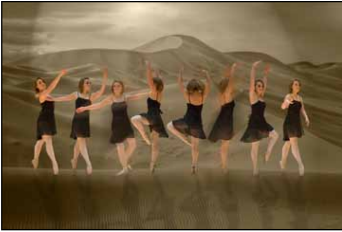
“Light, Camera, Action” by Lynne Anzenc