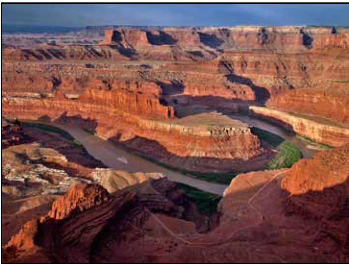
“Dead Horse Point” by Julius Kovatch