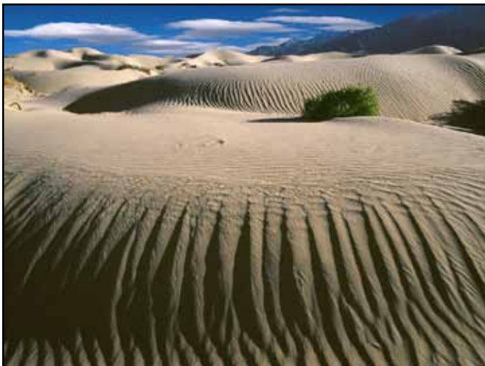
“Death Valley Sand Dunes”