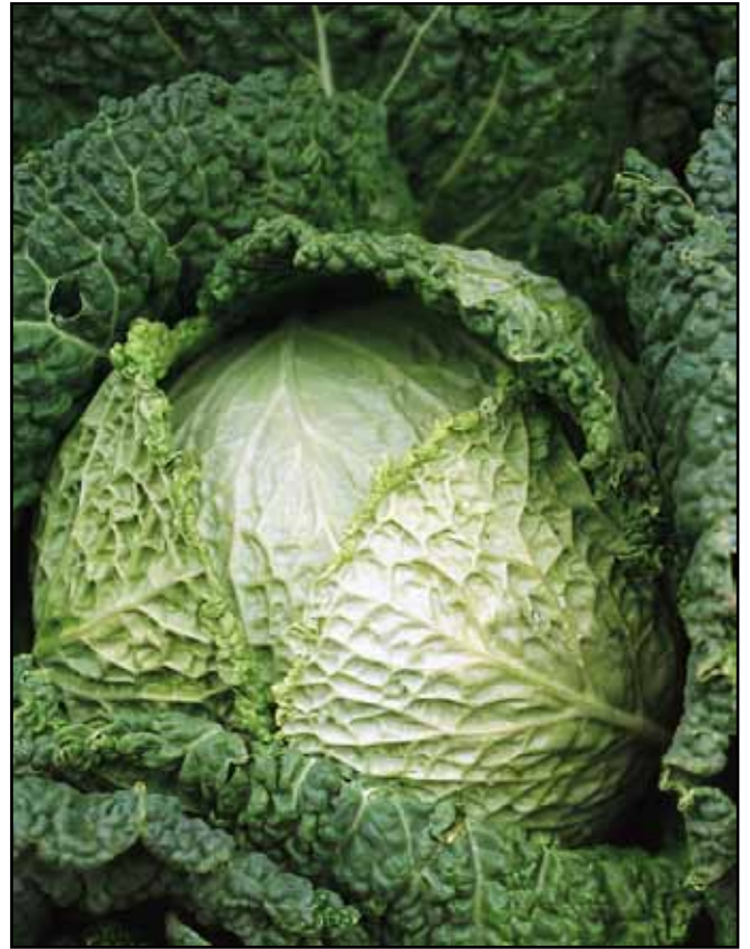
"French Cabbage" by Gary Cawood