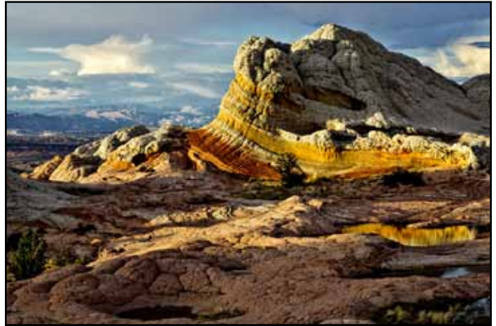
“White Pocket”