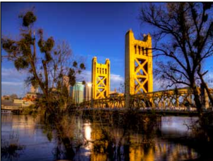
"Tower Bridge Light" by Grant Kreinberg