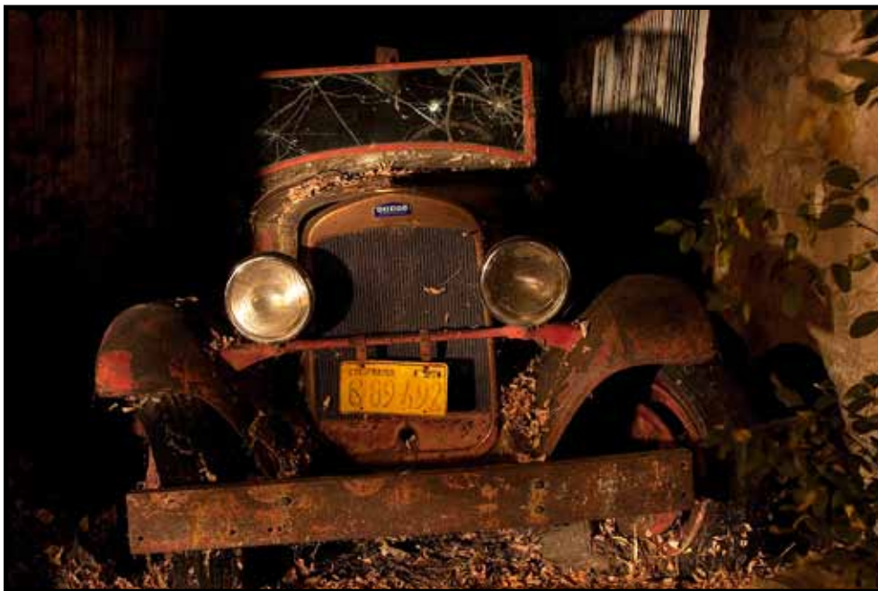
General Photography Image of the Night Old truck in Mokelumne Hill by Kristan Leide-Lynch

Volume 74 Number 5 * May 2011 * www.sierracameraclub.com