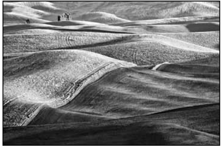
“Palouse”