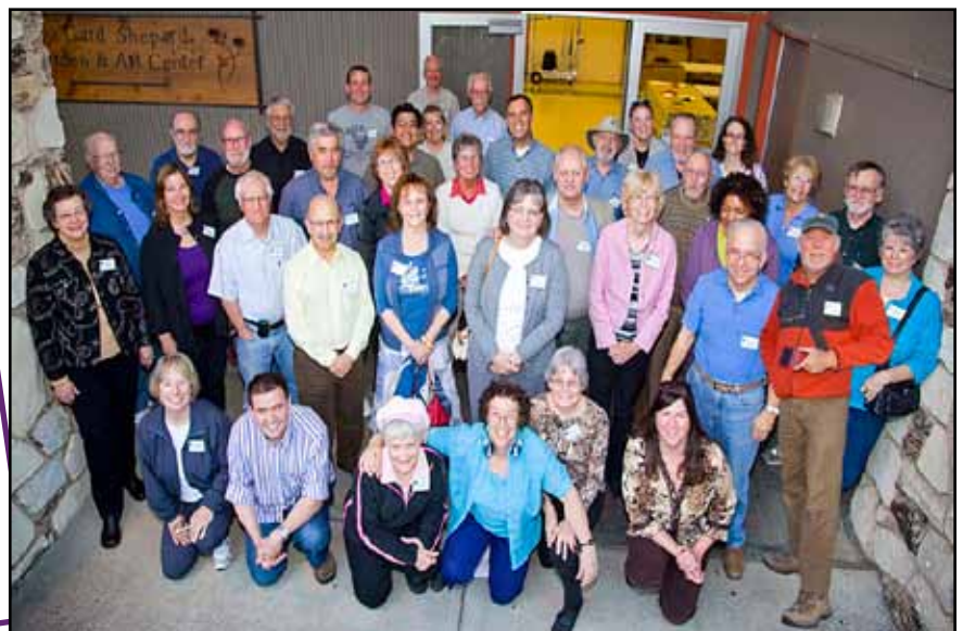
Sierra Camera Club Group Photo, April, 2011