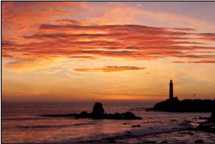
“Pigeon Point Lighthouse” by Jan Lightfoot