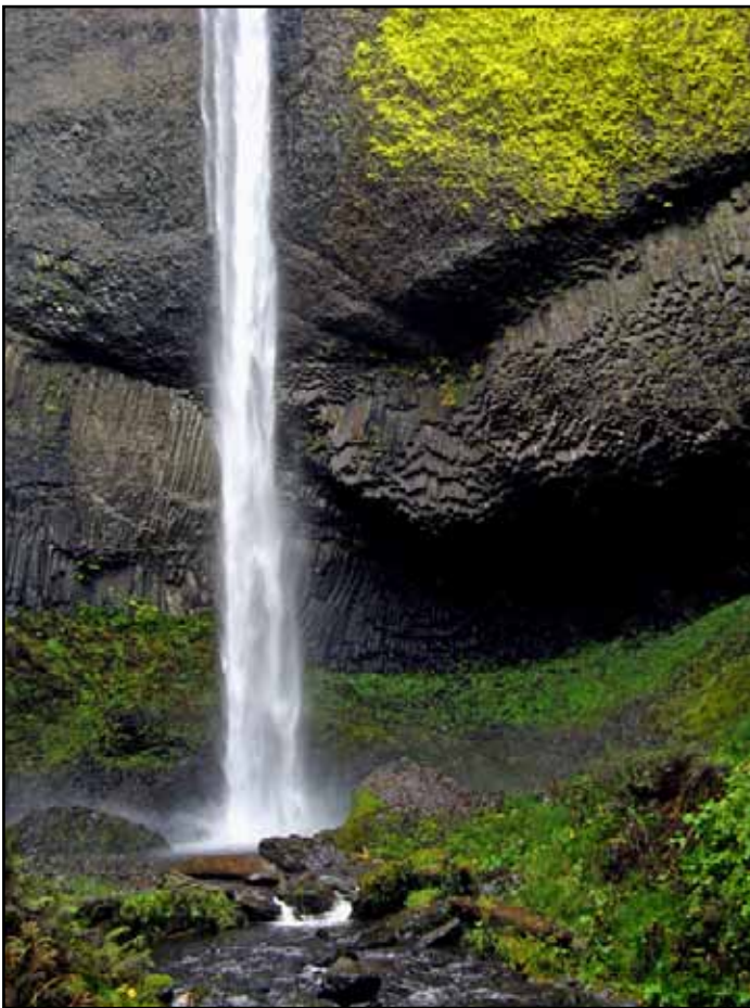
"Columbia Gorge Waterfall" by Al Judd