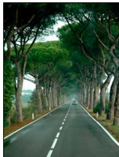
“Italian Byway” by Marcia Sydor

Only one way to describe the recent weather, wet, wet, wet. While it is making it difficult to get out and shoot images, all of the rain and snow will make for lots of flowers, big waterfalls, and lots of birds nesting in the next few weeks. Don’t forget to check our Meet-Up group, Exploring Photography for great picture taking opportunities.