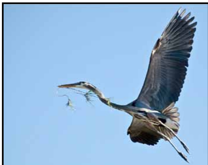
Nature Image of the Night “Great Blue Heron Gathering Nesting Material” by Werner Krueger