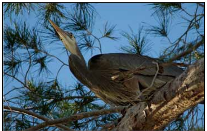
"Great Blue Heron (Ardea Herodias) #1" by Werner Kruger