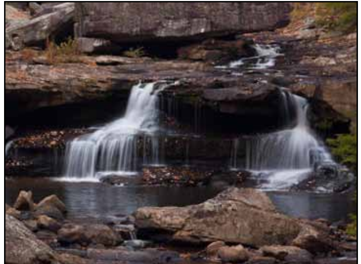
“Glade Creek Grist Mill.”