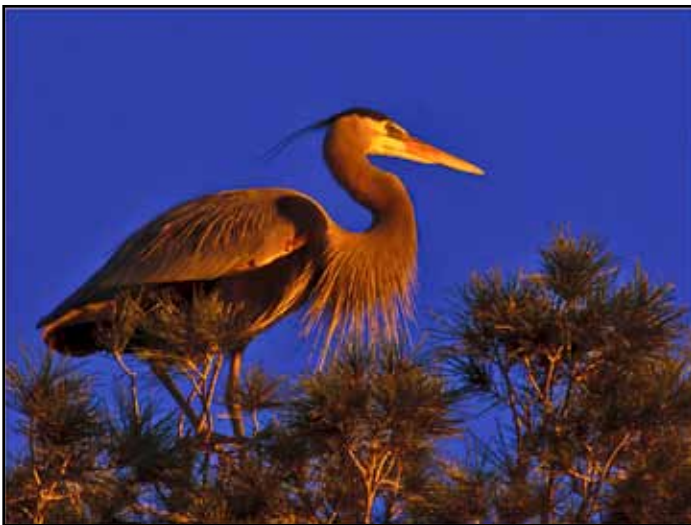
“Great Blue Heron ( Ardea Herodias) at Dawn”