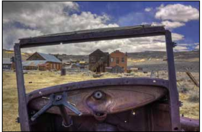
“Front Seat View of Bodie” by Lynne Anzelc