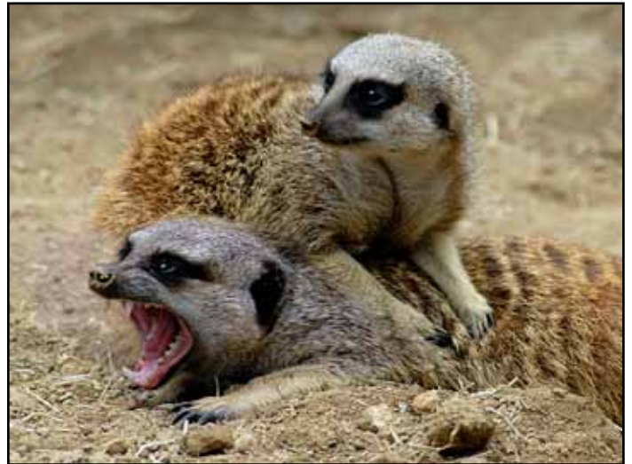
“Meerkat Warns Intruder” by Willis Price