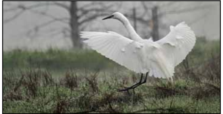
Great Egret Landing on Dewy Field”