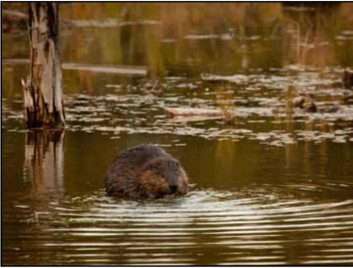
“Ontario Beaver Eating Last Fall Bark Before Ice Over” by Glen Cunningham