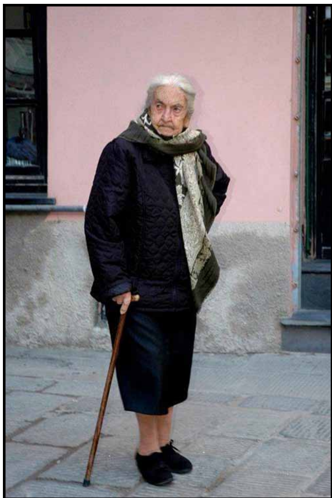
Travel Image of the Night “Italian Lady” by Marcia Sydor

Volume 74 Number 4 * April 2011 * www.sierracameraclub.com