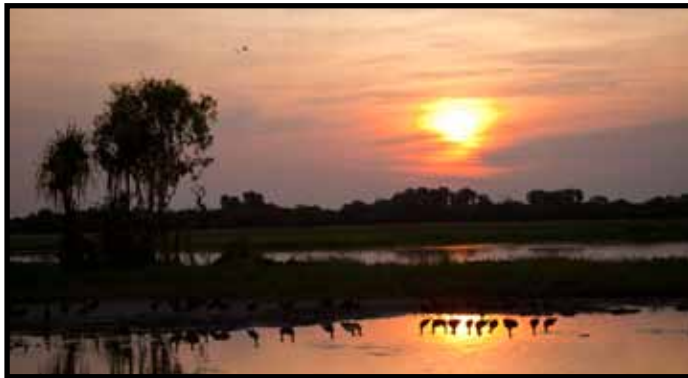
“Ferro Fantasy” by Willis Price