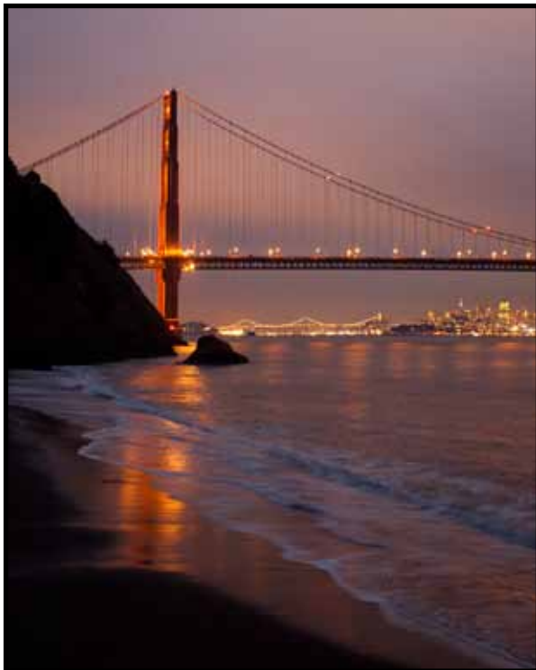
“North Tower” by Grant Kreinberg