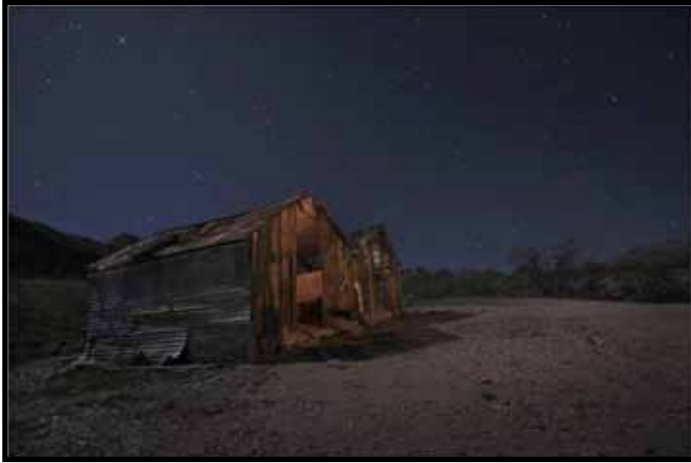
“Rhyolite Shacks” by Peggy Seale