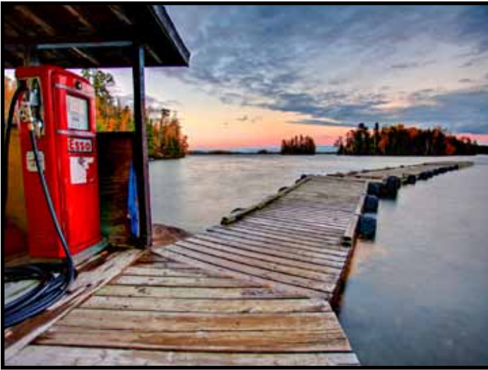
“Crow Lake Dock at Sunset” by Glen Cunningham