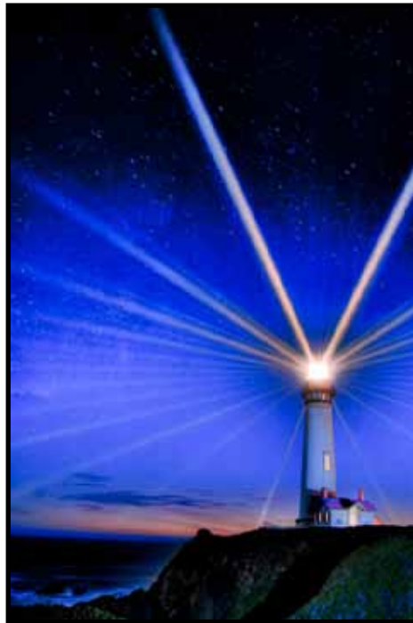
“Pigeon Point Lighthouse” by Ron