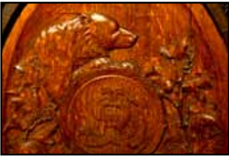
by Gay Kent

Last month the Exploring Photography Meetup Group had special access to the Schramberg Champagne (we have to call it Sparkling Wine in California) Caves to practice some low light,