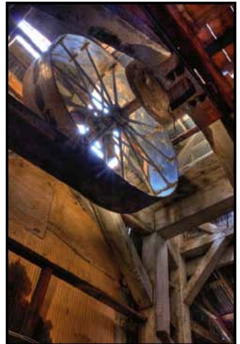
“Bodie Stamp Mill” by Lynne Anzels