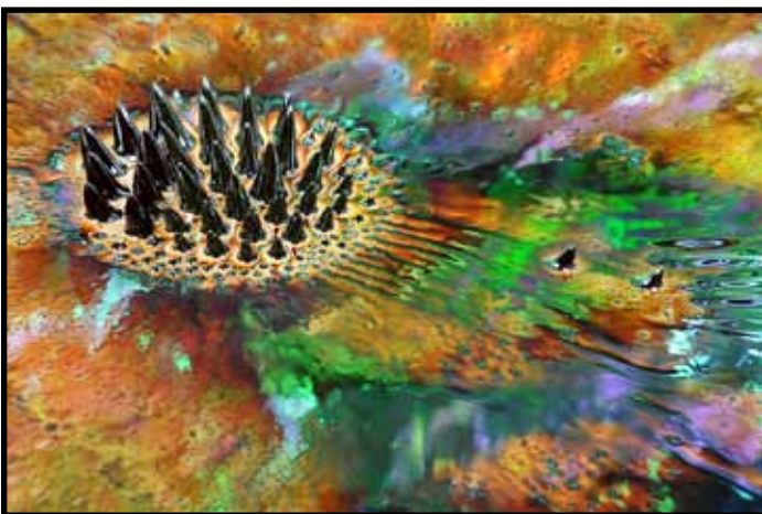
“Ferro Fantasy” by Willis Price