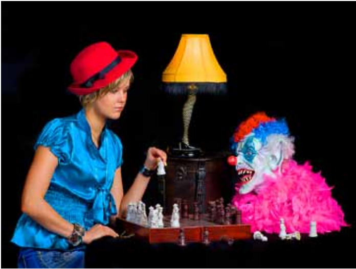
“Your Move” by Truman Holtzclaw