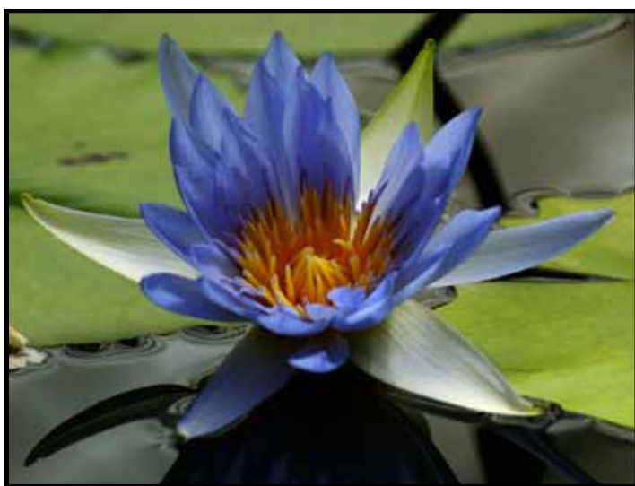
"Blue Water Lily" by Jeanne Snyder