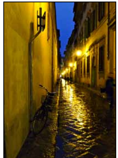
“My Street in the Rain” Florence