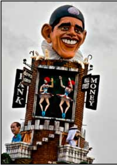
“Obama Pops Out of the Float” Viareggio Carnevale

This is my ninth year of coming here for a couple months at a time, and this historic city has become my second home. I have a wonderful rented flat with all of the conveniences (especially an oven, washer and wi-fi). Now all my neighbors and the vendors at the open market nearby recognize me and welcome me back.