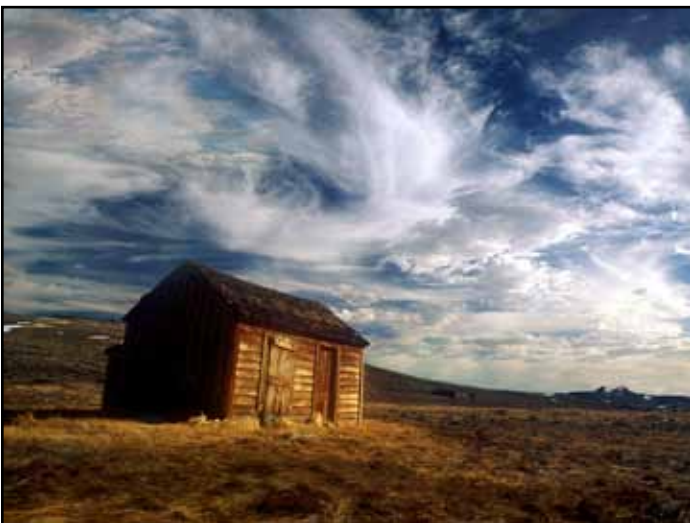
“Bodie Cabin” by Willis Price