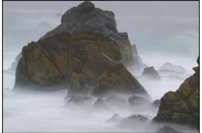
“Mystic Island” by David Grenier