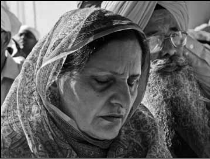
“At Prayer, Sikh Festival” by Sande Parker