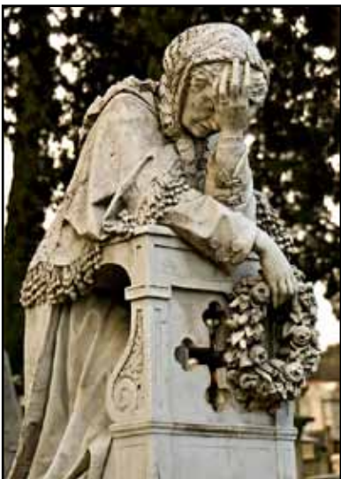
“Marble Marker, English Cemetery” Florence