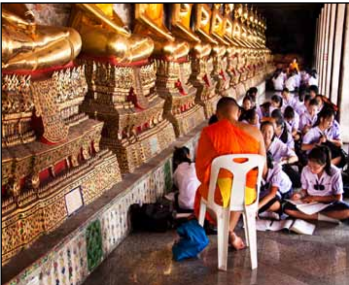
“Thai Kids get Buddhist Lessons”