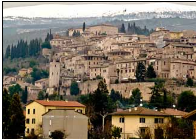
“Snow on Monte Subasio” Spello