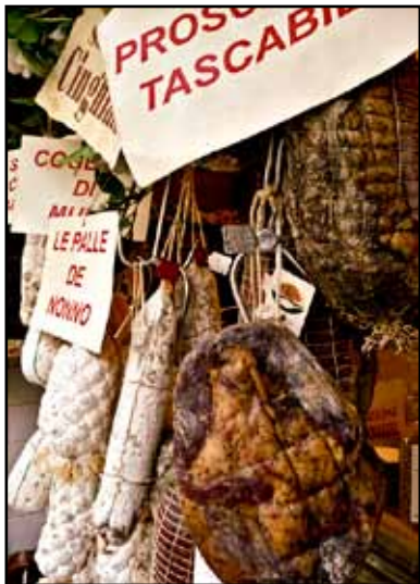
“Butcher Shop Local Specialties” Spello