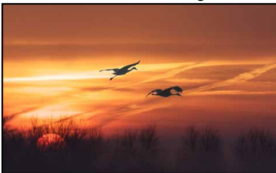
NATURE: "Sandhill Cranes Take Flight at Sunrise" by Valarie Trudeau