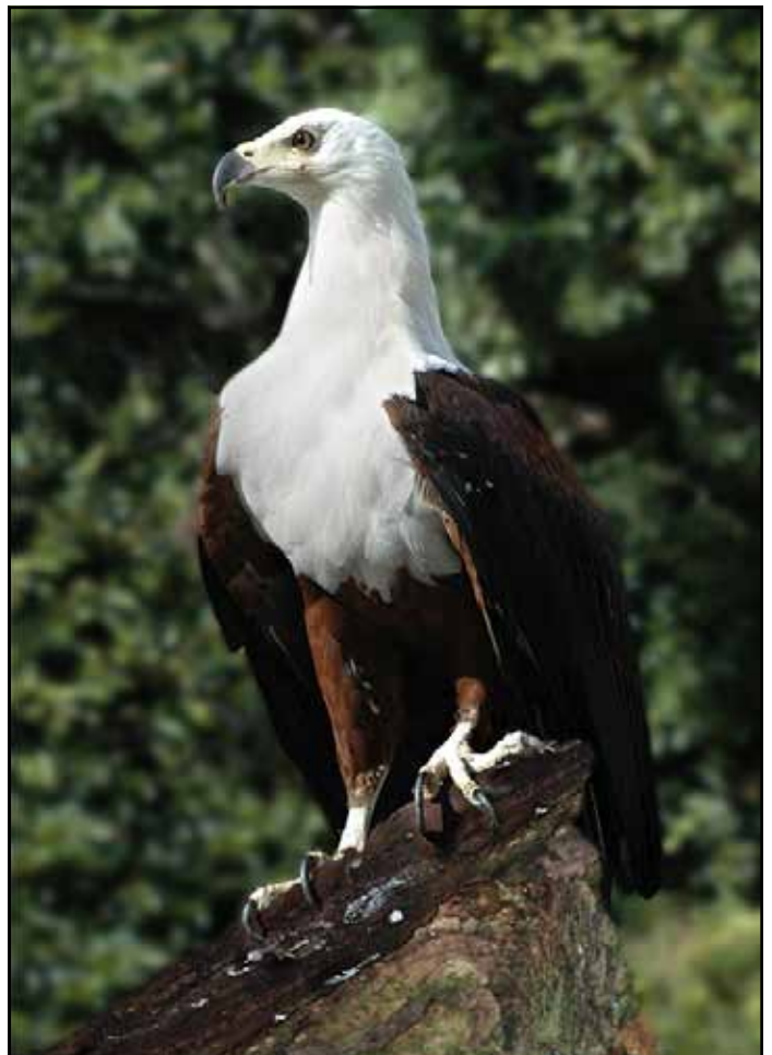
“African Fish Eagle” by Willis Price