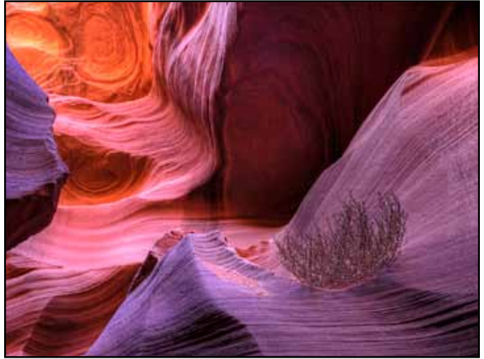
“Antelope Canyon” by Lynne Anzelc