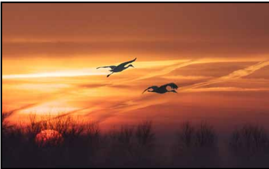
NATURE: "Sandhill Cranes Take Flight at Sunrise" by Valarie Trudeau