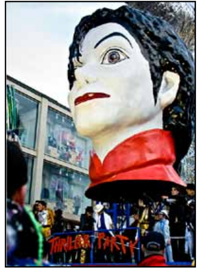
“Michael Jackson Thriller Float” Viareggio Carnevale