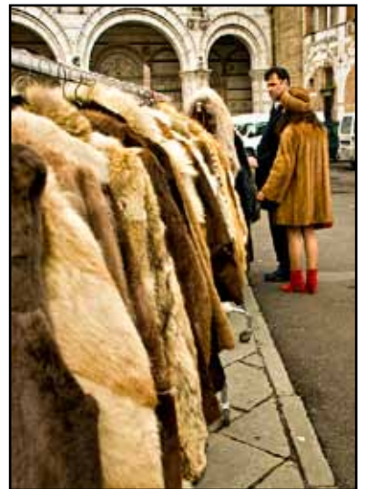
“Shopping for Used Fur Coats” Lucca