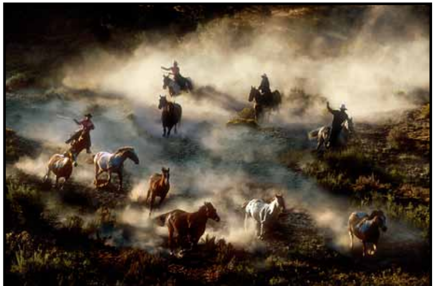
TRAVEL: "Horses and Dust" by Willis Price

Preston Castle Photographer's Day Saturday May 22. For tickets go to www.prestoncastle.com/photoday.html