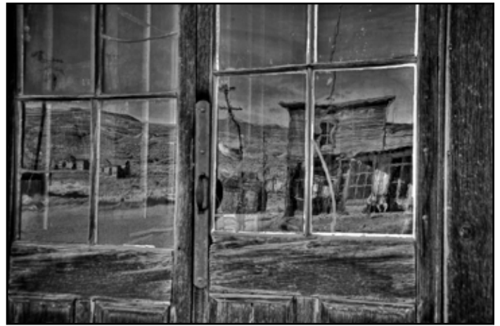
“Bodie Window Reflection” by Ron Larsen