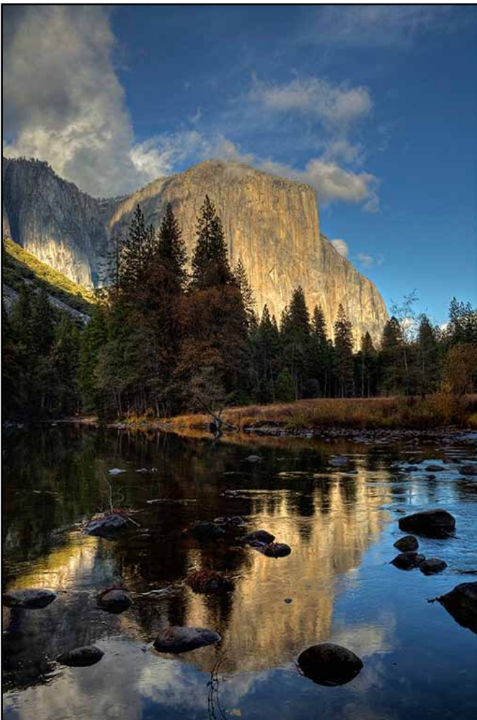
“Yosemite Valley”