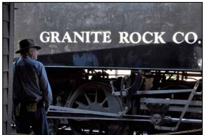
“Rail Road” by Valarie Trudeau