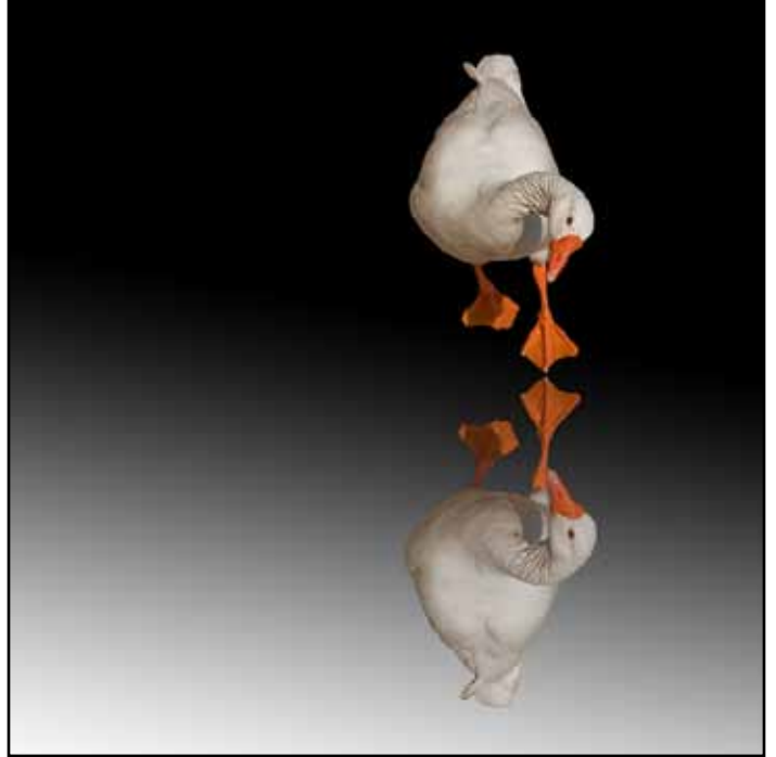
“Goose” by Lynne Anzelc