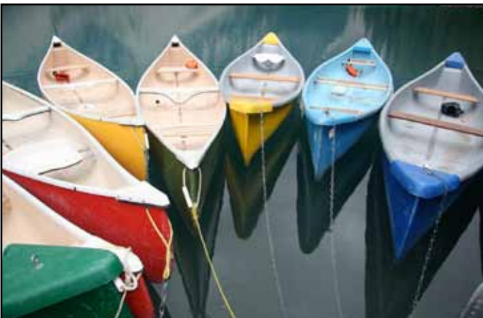
“Circle of Canoes” by Valarie Trudeau