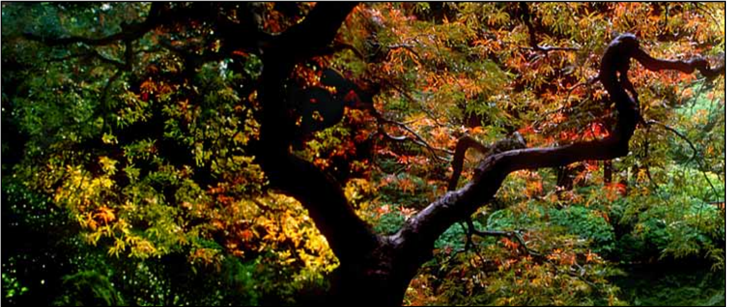
“Japanese Garden” by Willis Price